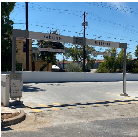
Baylor Street Entrance