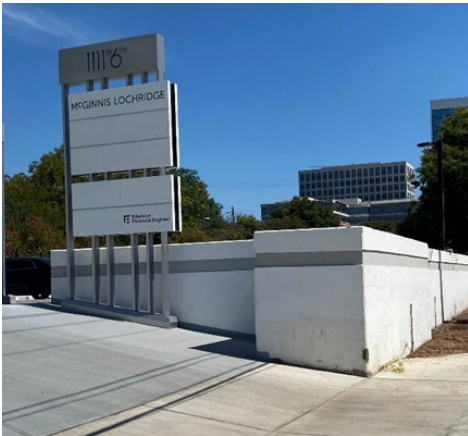
5 th Street Entrance